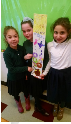
Grade 3—Learning about the world map.