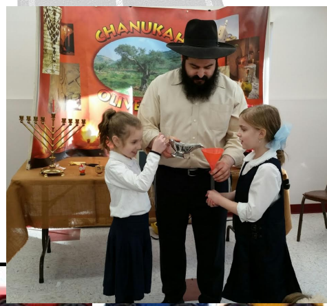
א separating the oil from the olives

A MESSAGE FROM PTA Please look out for א cards sent home with your child. Please take the time to write a note expressing your א to your child's teacher and send back to school so they can be presented along with the א . Thank you.