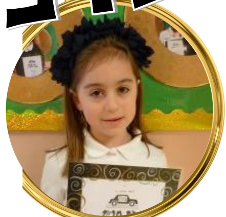
כתה א' Mussi Bruk