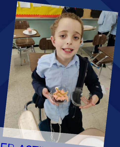
2ND GRADE LAG BAOMER ACTIVITY