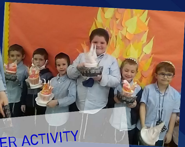
1ST GRADE LAG BAOMER ACTIVITY