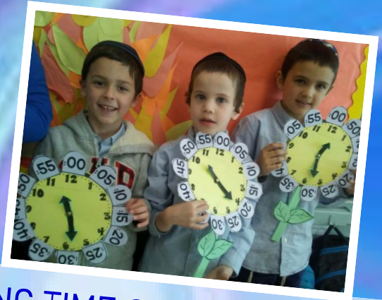
1ST GRADE TELLING TIME ON THE ANALOG CLOCK