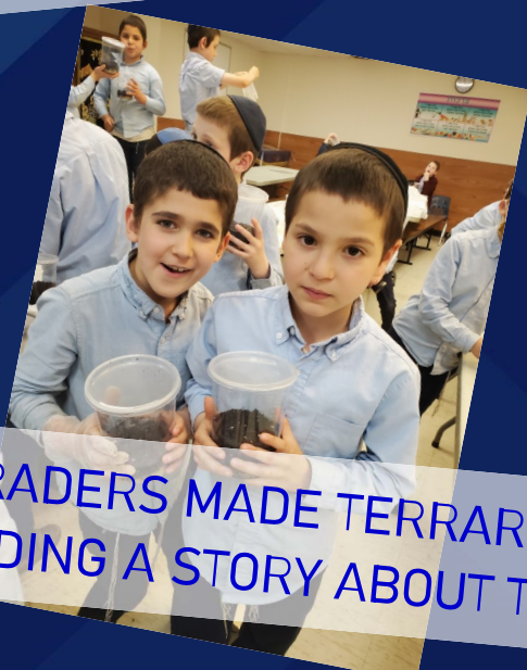
THE 3RD GRADERS MADE TERRARIUMS AFTER READING A STORY ABOUT THEM