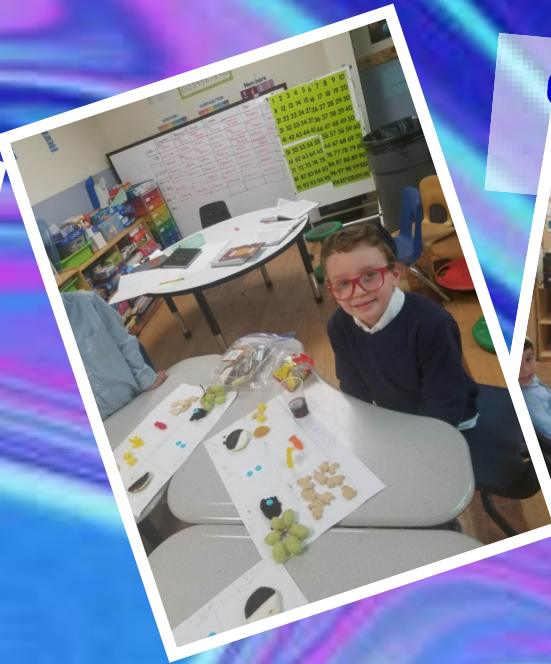
CHUMASH SIYUM OF 6 DAYS OF CREATION IN ENRICHMENT CLASS