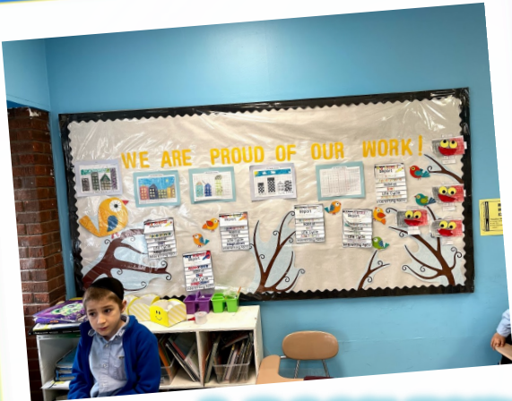
A PEEK INTO GRADE 3A