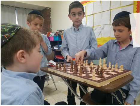
2ND GRADE AT RECESS